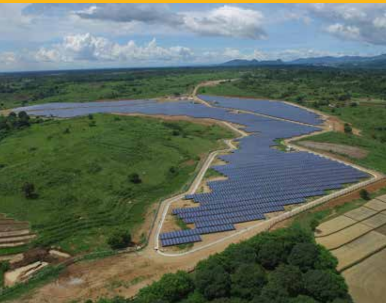
Pampanga, Philippines 10 MWp